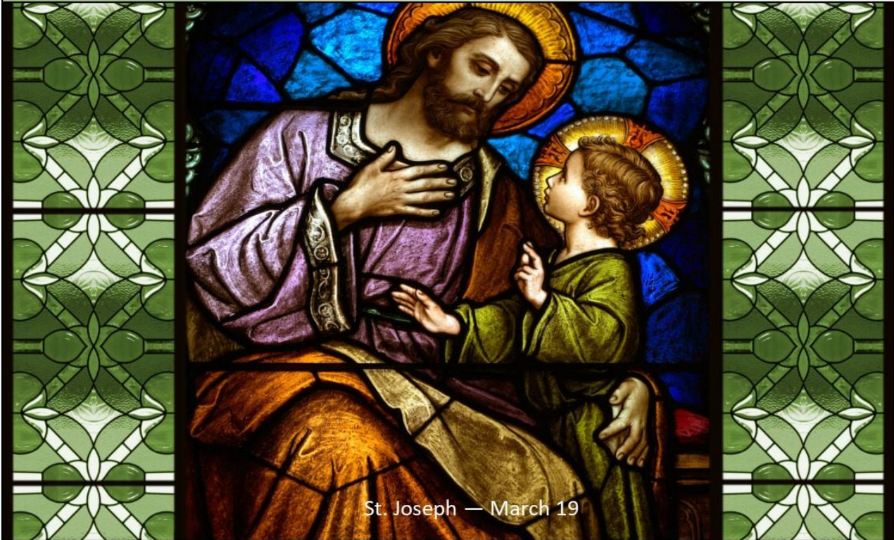
St. Joseph — March 19