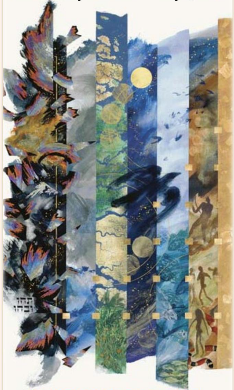
St. John's Bible, "Days of Creation"