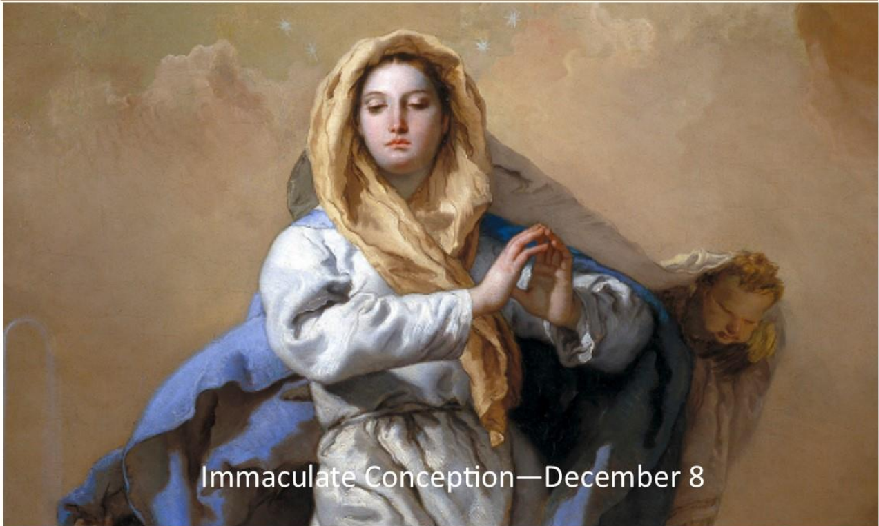
Immaculate Conception—December 8